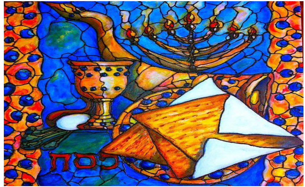
Painting by Rae Chichilnitsky

Collation of social justice Haggadot and resources <a href="https://avodah.net/passover/">https://avodah.net/passover/</a>